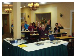
Some of the voting members