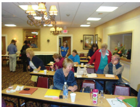
Participants of the 2010 PARID Conference in Erie, Pennsylvania